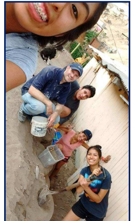
Shovelling sand with the youth at San Pablo mission!

The major flooding, accompanied by landslides, that hit Peru during this “El Niño” year left more than 100 dead and hundreds of thousands affected. The whole of Lima where we live, along with around 10 million others, was without its water supply for days. We have been ferrying water to those without, gathering donations of food, blankets, clothes, and helping those who have lost their homes by setting up kitchens, providing blankets, mosquito nets and children’s school supplies as part of the church’s response. Grateful victims of the flooding share generously with us