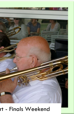
rt - Finals Weekend