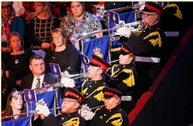
Festival of Remembrance at the Royal Albert Hall

27 “I am leaving you with a gift - peace of mind and heart. And the peace I give is a gift the world cannot give. So don’t be troubled or afraid.”